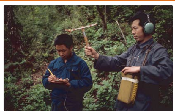
Using radio tracking to follow giant pandas, Wolong Nature Reserve, China

1. In 1992, the "National Conservation Management Plan for the Giant Panda and Its Habitat" was created, a major milestone in the first decade of cooperation between WWF and China's State Forestry Administration. The plan, which WWF is helping to implement, calls for additional nature reserves,