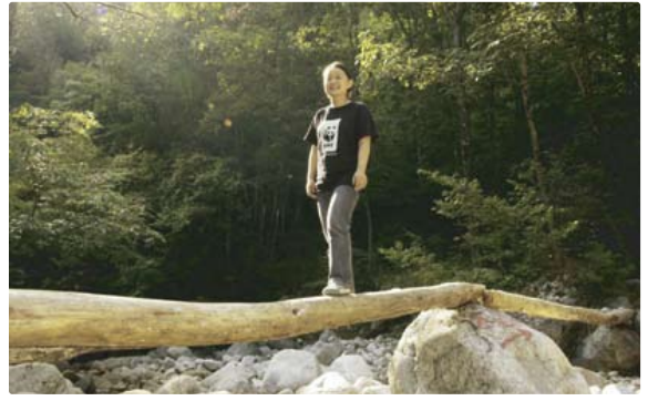
WWF volunteer taking visitors into giant panda habitat, Qinling Mountains, China

improvements to existing reserves, and the creation of habitat corridors to reconnect isolated panda populations. By mid-2005, the Chinese government had established over 50 panda reserves, protecting more than 10,400km<sup>2</sup> and over 45 per cent of remaining giant panda habitat.